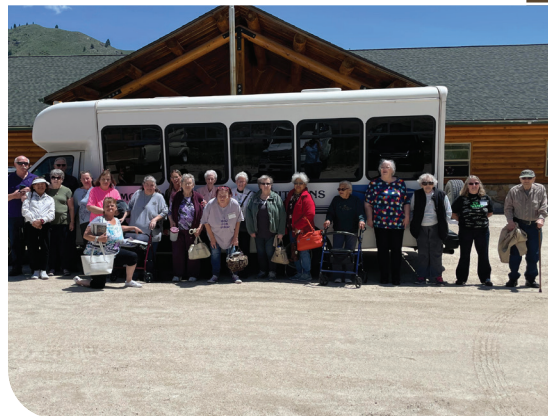
Ensuring homebound or transportation-limited seniors and people with disabilities have access to nutritious, balanced meals can be a challenge. Fortunately, a St. Luke's grant allowed the Mountain Home Senior Center to provide 23,500 Meals on Wheels meals and 5,400 congregate meals to Elmore County residents.