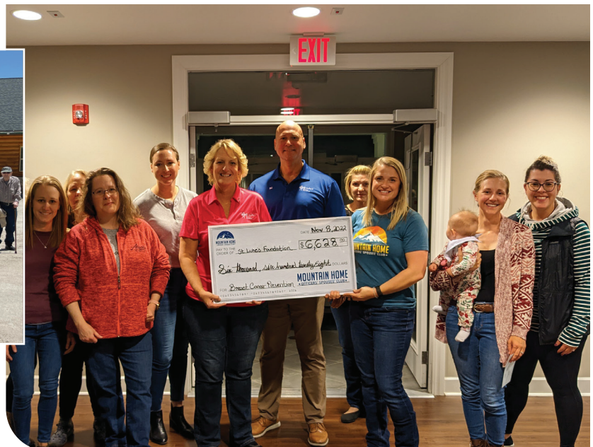
The Officers Spouses Club at Mountain Home Air Force base is one of the largest supporters of St. Luke's Elmore Foundation's Mammography Fund. Their generosity provides access to hundreds of free mammograms for our community and will help fund a 3-D Mobile Mammography Unit to be used in Elmore and Twin Falls counties.