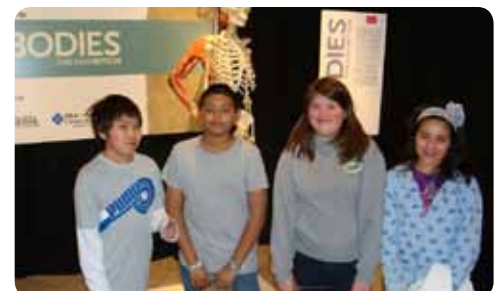
Students from BCTAC II and IDFY visit the BodyWorlds exhibit at the Museum of Idaho.