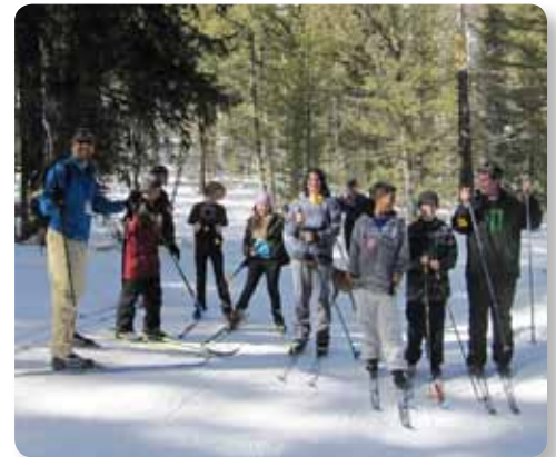
Skiing the trails at Galena Lodge is a great activity for BCTAC II.

This year, BCTAC II has worked with over 75 students and offered several new programs. We are excited about the opportunities that we can provide for youth, and the support of the community has been a big part of our success! We are currently looking for adult volunteers, activity leaders, and sponsors to help with our afterschool programs. To get involved, please contact us.