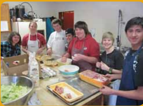
Students cooking a community meal at Souper Supper.