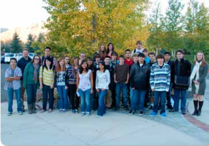
Students who make a difference: the BCTAC group at Wood River High School.